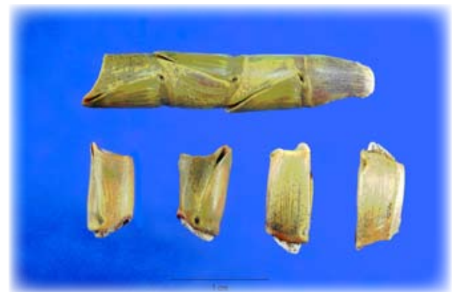
Fig. 6: Eastern gamagrass seed units (caryopsis surrounded by cupulate fruit-case).

matrix priming with incorporated gibberellic acid was not as successful at breaking dormancy of intact seed units as cold, moist stratification (Rogis et al., 2004b). Soaking intact seed units in solutions of sodium hypochlorite or applying KNO_3 as a moistening agent to intact seed units did not enhance germination percentage (Ahring & Frank, 1968). Soaking intact seed units in ethylene chlorohydrin solutions increased germination percentage, but was not as effective as cold, moist stratification. Surrounding intact seed units with an elevated ambient carbon dioxide concentration during cold stratification (moist or dry) did not increase the germination percentage (Anderson, 1985).