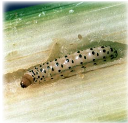
Fig.10: Southern corn stalk borer larva.

avoiding damage to eastern gamagrass from the southern corn stalk borer is to remove thatch from the crop before winter. Farmers should be alert for this pest because it is highly destructive and can result in severe losses in crop yield of eastern gamagrass. Through rigorous management practices to prevent accumulation of thatch on the fields, it is possible to minimize the pest problem.”