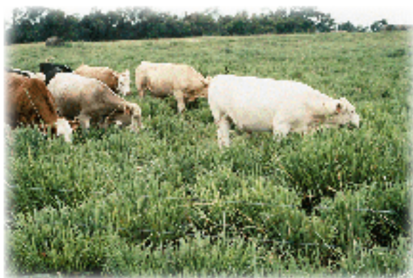
Figure 16: Eastern gamagrass pasture.