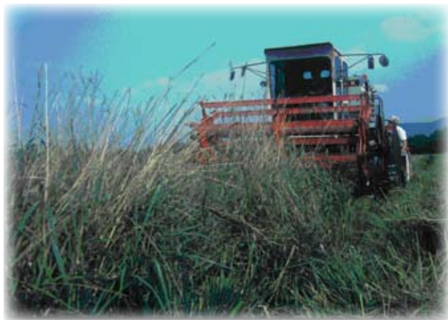
Fig. 15: Eastern gamagrass seed harvest.

Investigations with two seed lots revealed that only 35 to 37 percent of seed units contained a caryopsis (Row, 1998). The percentage of seed units containing a caryopsis has a major impact on seed purity, germination test results, and ultimately field emergence. An increase in the percentage of gamagrass seed units that contained a caryopsis was obtained by partitioning seed units using either an air fractionating aspirator (Carter-Day, Model No. GF 21, Minneapolis, Minnesota) or a gravity separator (Oliver MFG, Rocky Ford, Colorado) following the cleaning of gamagrass seed units with an air seed cleaner (Clipper M2B. A.T. Ferrell and Co., Saginaw, Michigan) (Douglas et al., 2000b). Krizek et al., (2000) showed that 21 days at a constant temperature of 86° F is sufficient time for conducting eastern gamagrass germination tests.