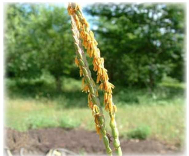
Fig. 1: Eastern gamagrass spike with male flowers on top with extruded anthers, and cupulate fruit-cases on the bottom.

General: Grass Family (Poaceae), tribe Andropogoneae, and subtribe Tripsacinae. It shares the same subtribe as corn ( Zea mays ). Eastern gamagrass is a native perennial bunchgrass and a distant relative of corn. It is a long-lived (to 50 years), warm-season species native to most of the eastern half of the United States. It ranges in height from 4 to 8 feet. The leaf blades are flat, long (12 to 30 inches) and wide (0.4 to 1.2 inches), with a well-defined midrib. It reproduces vegetatively from thick, knotty, rhizome-like structures called proaxes. The spikes are 6 to 10 inches long and are made up of one to several spikes. Similar to corn, eastern gamagrass has separate male and female flowers (monoecious). But unlike corn, each gamagrass spike contains both male and female flowers. Male flowers occupy the top three-fourths of the spike and female flowers the bottom one-fourth (Fig. 1).