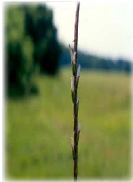
Fig. 14: Ergot sclerotia (cream colored) protruding from seed units on female portion of eastern gamagrass spike.

Ergot was observed on spikes of Highlander eastern gamagrass in Mississippi (Fig.14) (J. Grabowski, personal communication, 2005). Although it has not been positively identified, this ergot is believed to be Claviceps tripsaci , which has previously been reported on eastern gamagrass seedheads (Hardison, 1953).