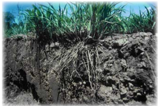
Fig. 4: Evacuation displaying eastern gamagrass roots.

In western Kentucky, cow-calf pairs were grazed on either eastern gamagrass or Caucasian bluestem ( Bothriochloa bladhii ) and bermudagrass ( Cynodon dactylon ) during June through early September (Pingel, 1999). The data from this study was not statistically analyzed, but the author observed that eastern gamagrass maintained more consistent forage production across the grazing season than Caucasian bluestem and bermudagrass. Gamagrass forage production did not decrease as rapidly as that of Caucasian bluestem and bermudagrass across an August-September low rainfall period.