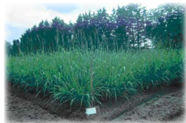
Fig. 7: Excellent stand of eastern gamagrass.

According to a study by Row (1998), the use of thiram increased the percentage emergence of stratified seed units, but the percentages were not statistically different ( P < 0.05 ). Some commercial eastern gamagrass seed producers recommended a longer cold period – up to 20 weeks (Dewald, 1993). The soil must remain