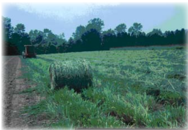
Fig. 9: Eastern gamagrass hay.

In contrast to grazed gamagrass, the crude protein percentage of harvested gamagrass cut for hay remains high across the growing season when nitrogen fertility is adequate, because clipping uniformly stimulates regrowth. The crude protein percentage of gamagrass hay, across clipping