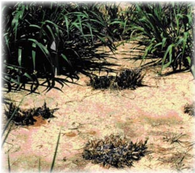
Fig. 12: Disease symptoms caused by Pythium and Rhizoctonia species on 'Jackson' eastern gamagrass.

The eastern gamagrass cultivars 'Highlander', 'Jackson', and 'Pete' were compared in replicated entry trials for either one or two years (2001-2002) at three locations (Coffeeville, Prairie, and Raymond, Mississippi) (Grabowski et al., 2003). None of the plants of Jackson survived after 2001 at Coffeeville. These plants showed signs of damage from disease symptoms caused by Pythium species and Rhizoctonia species (Figs. 12 & 13).