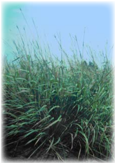
Fig. 2: Eastern gamagrass with visible leaf blades and terminal spikes.

Terminal spikes occur on the top of the stem, and lateral spikes occur at the leaf axil, which is the angle between the leaf and stem. Seed is produced from June to September, resulting in uneven maturation. The spike ripens from the top down and is susceptible to shattering. Gamagrass seed yield is low and it does not reseed adequately from established stands. A gynomonoecious form was found with both male and female (perfect) flowers on the top three-fourths and female flowers on the bottom one-fourth of the spike. The perfect flowers are male sterile except at the very tip (Dewald & Dayton, 1985). This plant is being used in breeding programs to increase seed production (Dewald & Sims, 1990; Salon, 1996; Salon & Earle, 1987). Eastern gamagrass occurs predominantly at the diploid ( 2n = 2x = 36 ) and tetraploid ( 2n = 4x = 72 ) levels although triploids ( 2n = 3x = 54 ), pentaploids ( 2n = 5x = 90 ), and hexaploids ( 2n = 6x = 108 ) have been reported (Farquharson, 1995). Only the diploid plants are sexual and cross-pollinated. The tetraploids and the rest of the polyploids are apomictic (Burson et al., 1990). They produce seed asexually that is genetically identical to the mother plant. Pollination of apomictic plants is required for seed set and endosperm development.