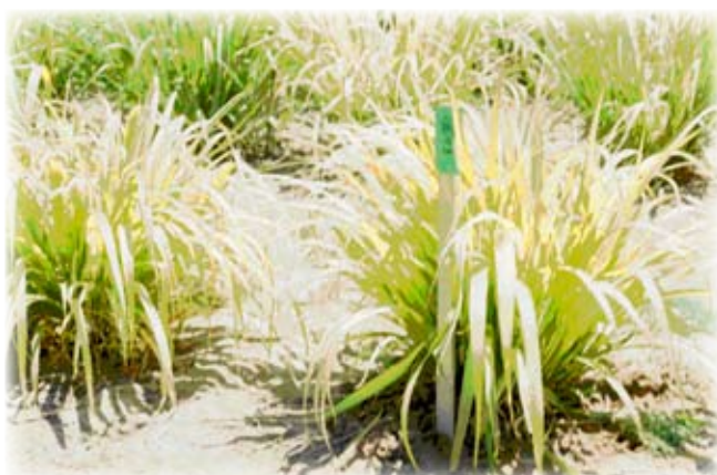
Fig. 3: Eastern gamagrass exhibiting yellow leaves when grown on a high pH soil in New Mexico. Yellow leaves are presumably caused by an inability to uptake iron from a high pH soil.

The indigenous U.S. range of eastern gamagrass extends from central Texas to southeastern Nebraska and central Iowa and east to the Atlantic Ocean (Rechenthin, 1951). Eastern gamagrass's range extends to Central and South America and the Caribbean (Tropical Forages, 2006). Gamagrass flourishes under dryland conditions where annual precipitation exceeds 35 inches (Dewald et al., 2006). Respectable forage production can be achieved on good soils in regions with 25 inches of annual precipitation. It can be grown in areas with less annual precipitation on irrigated and subirrigated land.