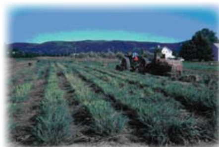
Fig. 5: Eastern gamagrass hayfield.

Forage silage and haylage – Corn is the crop that is most frequently grown for silage in the United States. Many of the forage yields for eastern gamagrass in Table 1 compare favorably with corn silage dry matter yields of 5.5 to 6.6 tons per acre in the Piedmont region of the Southeast and 6.9 to 10.0 tons per acre in the Corn Belt. In a Missouri study, eastern gamagrass ensiled from a first-cut at either the seed development or inflorescence emergence stage and regrowth, and at the proper moisture content produced good quality silage, but with lower dry matter digestibility than corn silage: 54.1 percent for gamagrass silage and 70.7 percent for corn silage (Brejda et al., 1994).