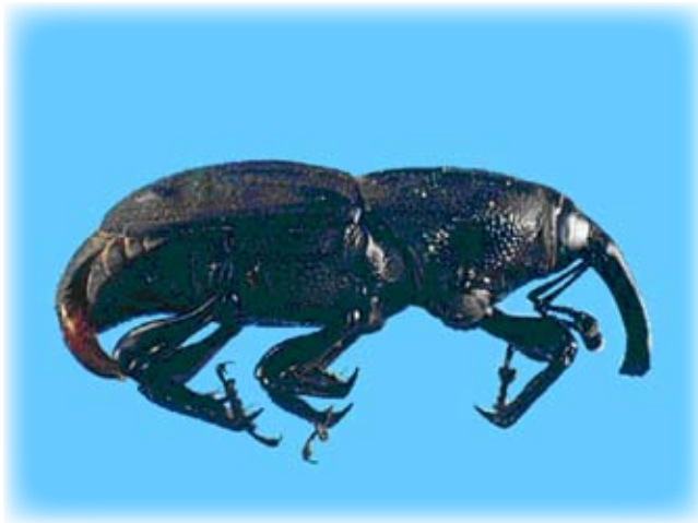
Fig. 11: Maize billbug.

during the life cycle of the pest will have a negative impact on seed production from the loss of reproductive tillers. Maize billbug damage may also contribute to the rate of center “die-out” of the plant crowns of eastern gamagrass. The control measures used in corn production may not be effective for eastern gamagrass. Research is needed to characterize the life cycle of maize billbug in eastern gamagrass and to determine effective methods of control.”