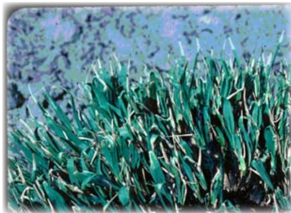
Fig. 8: Eastern gamagrass after spring burn.

Paul Salon, NRCS agronomist, states, "In the Northeast, grazing management and burning alone will not provide adequate weed control." Roundup 1 is labeled for use on pasture grasses; producers should follow the label instructions. Glyphosate can be applied "in early spring before desirable perennial grasses break dormancy and initiate green growth. Late fall application can be made after desirable perennial grasses have reached dormancy". For broadleaf weed control, 2, 4-D and dicamba are options; follow manufacturers' label for pasture and hayland.